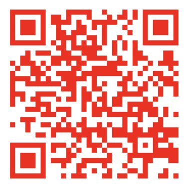
Scan for Google map

https://maps.app.goo.gl/DHasj3TZk4fAiuwn8